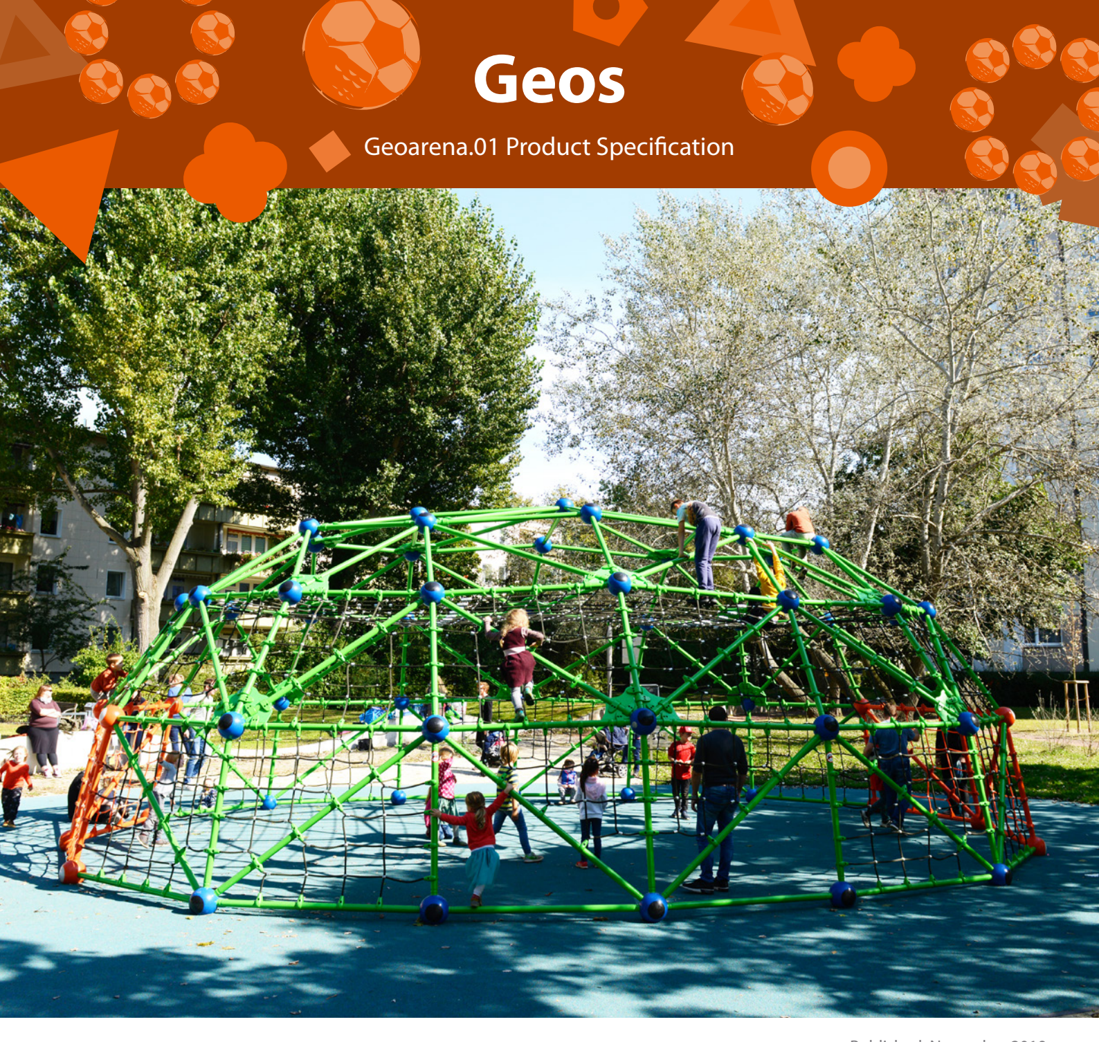
Published: November 2019