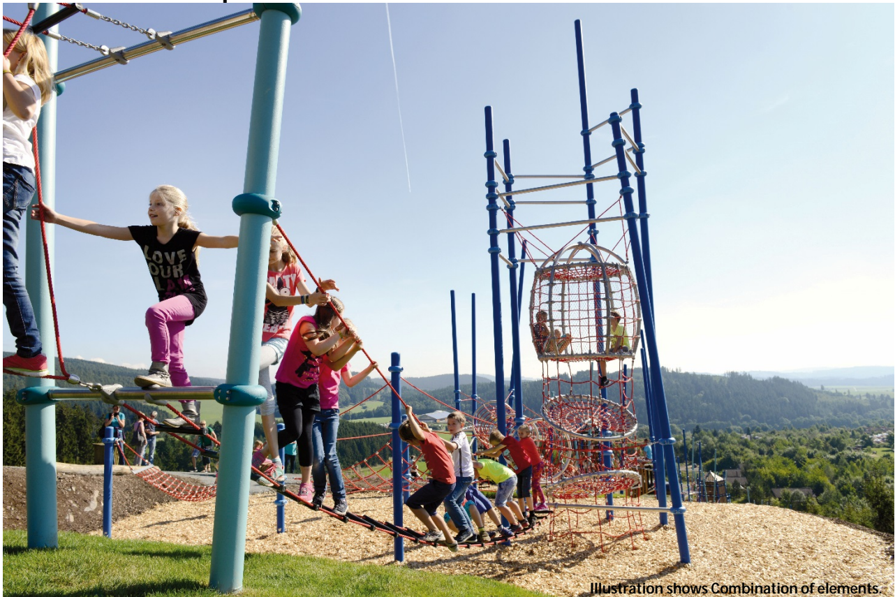
Illustration shows Combination of elements.