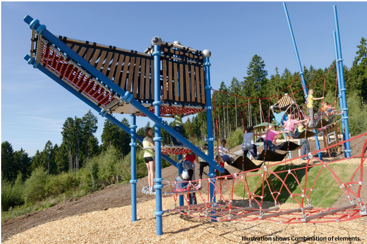
Illustration shows Combination of elements.

Tower6 This mysterious tower can be climbed via plate-shaped nets. Four meters above ground level, an angled reclining surface invites visitors to relax and also offers commanding views over the valleys below.