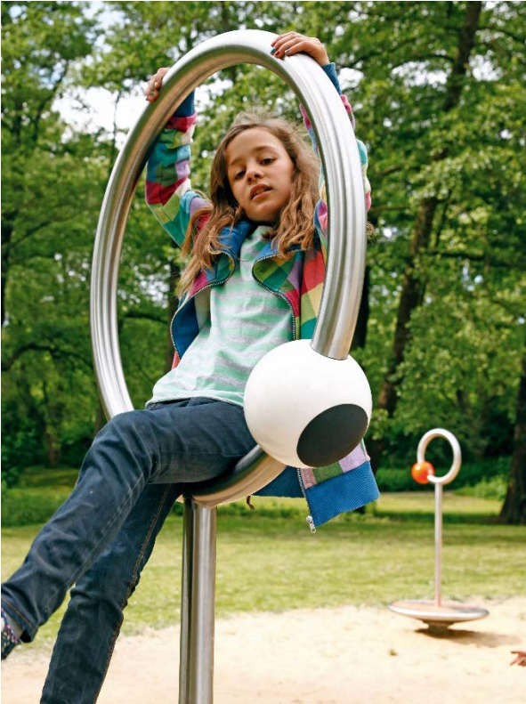
Cherry.140 The Cherry.140, with a climbing height of 1.40 m is more of a challenge and therefore teaches older kids good body control.