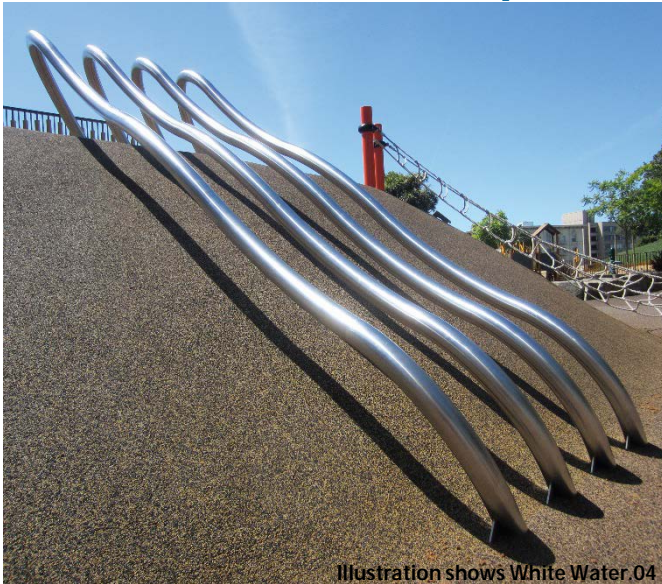
Illustration shows White Water.04