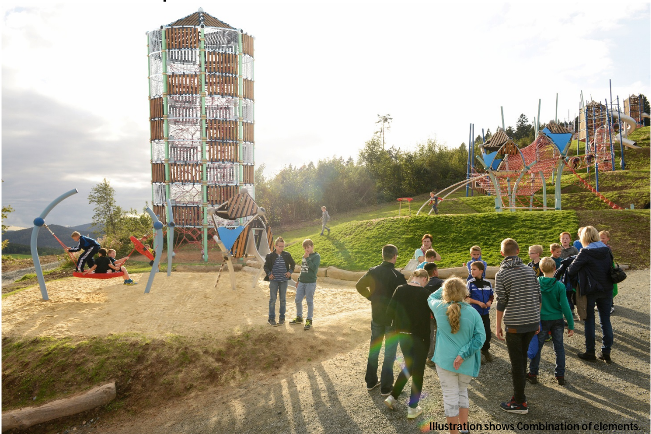
Illustration shows Combination of elements.