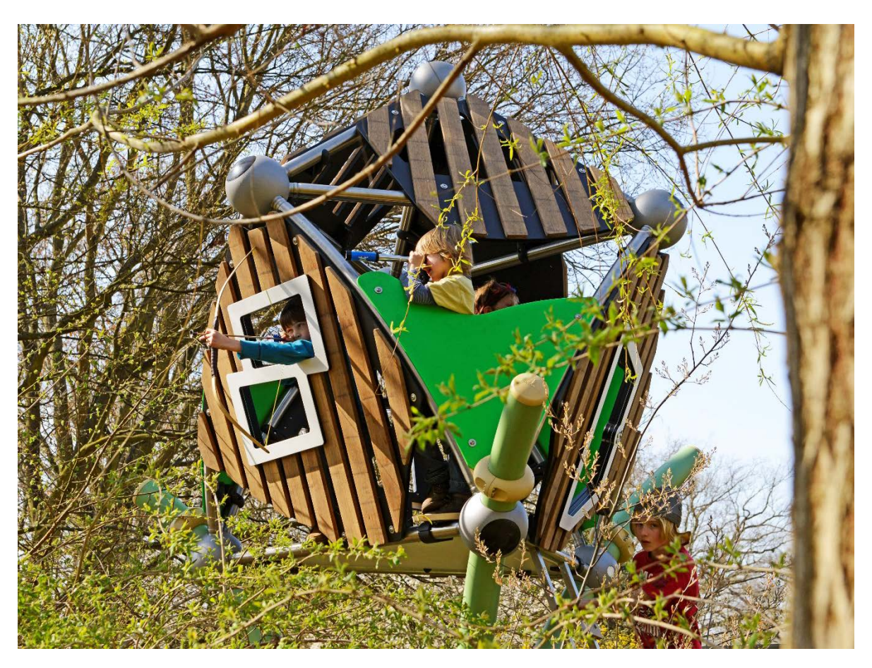
Trii1.01 The Trii1 is the small Greenville tree house here with an ladder as entrance possibility.