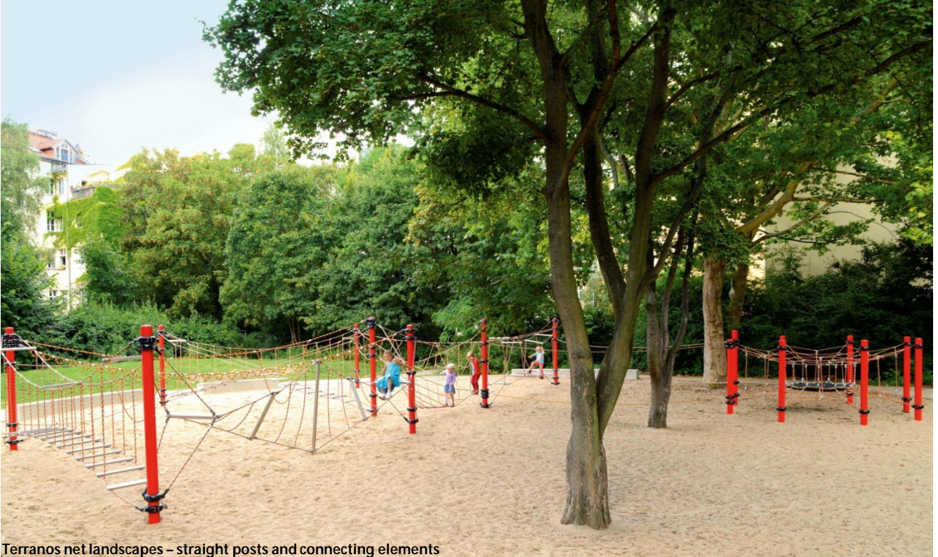
Terranos net landscapes – straight posts and connecting elements

Our netscapes offer children of all ages plenty of space for any kind of climbing, crawling, balancing and other physical activities. The highly accessible components are also the ideal place to get engaged in imaginative play or just hang around and relax.