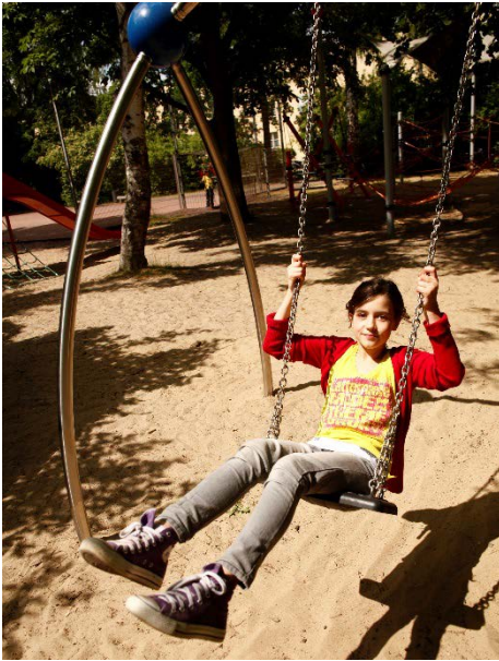
Swingo.2.3 The bigger one-bay-swing takes a child to new heights. In order to sustain the increased dynamics, the structure is supported by tripods.