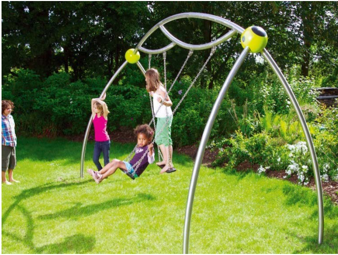
Swingo.2.2 The two-bay-version of the smaller Swingos is asymmetrical. That looks cool and it doesn't keep the two users from going to and fro in harmony.