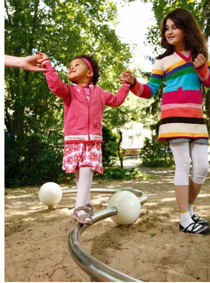
Orbit.02 The Orbit.02 has one curve more than the Orbit.01. For those who like having a longer balancing challenge from one end to the other.