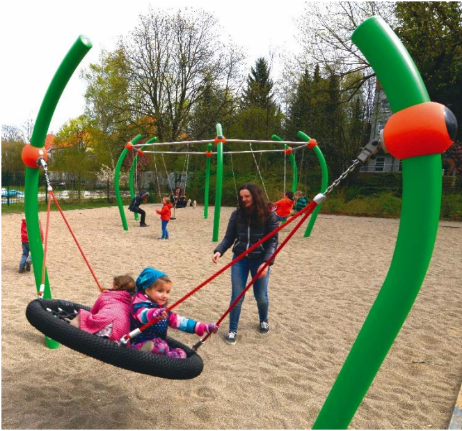
Cup Swing Discover the comfortable way of swinging with the Cup Swing and the Bowl Swing.